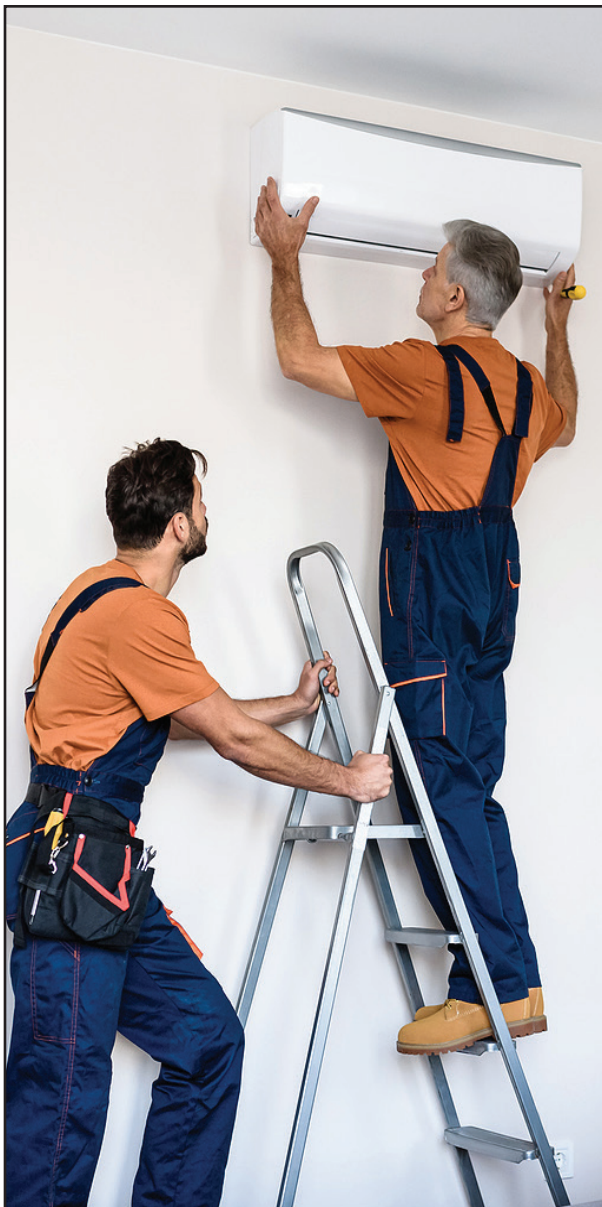
Heat pump being installed.